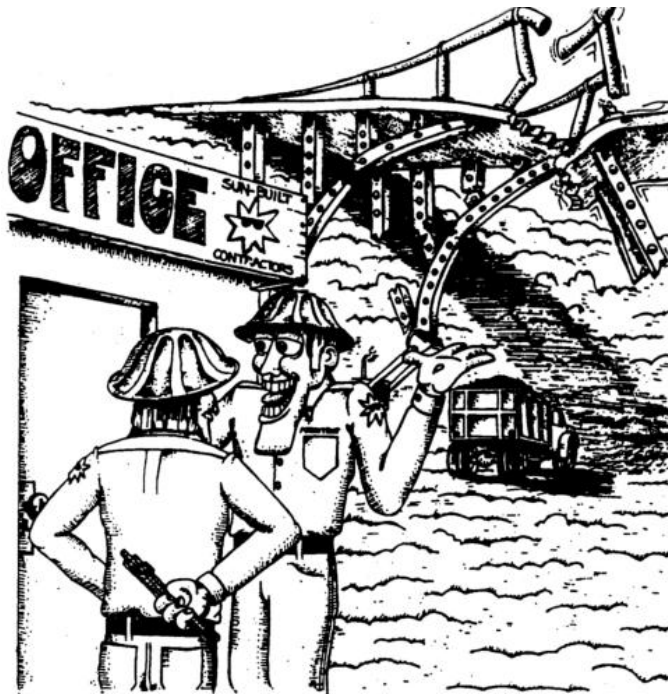
But boss, I just left out a decimal point. Don't I get at least partial credit?

Be sure to show all pertinent work for each problem ( not for True/False questions).